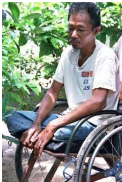
Cambodia mine victim, CBM Australia

The Micah Network Disability Forum had its inaugural meeting alongside the Asia Pacific Consultation.