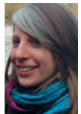
Sophie Lister writes for Culturewatch.org

► Note that the release of The Adjustment Bureau , which was discussed in the last issue, has been moved back to next spring.