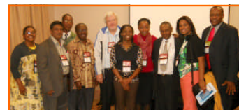
Part of the Caribbean contingent in Cape Town

"We would like The Cape Town Commitment to be seen