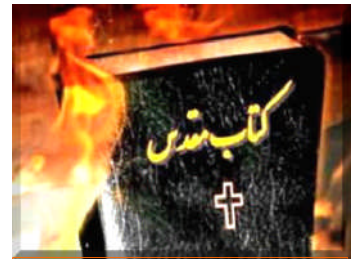
A Bible similar to the ones burned in Iran

EAC COMMENT: None of the so-called "tolerant" voices in the West that were raised against a fringe pastor's desire to burn about a dozen Qu'ans in Florida have said a word about the burning of hundreds of Bibles in Iran. It seems clear that "tolerance" is not applied to Christians and their sacred Scriptures. When will this