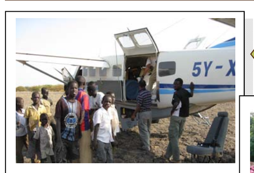
Sudan takes your breath away as you take a step back in time. The approach to Sudan and the sheer travel costs are intimidating