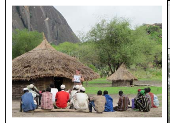
God's breath of life is creating Gospel communities. This is the work of the Lord that is wonderful in our eyes. The Ganza are hearing God's word