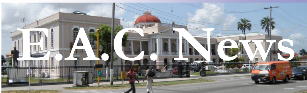
Picture: Parliament Buildings, Georgetown, Guyana