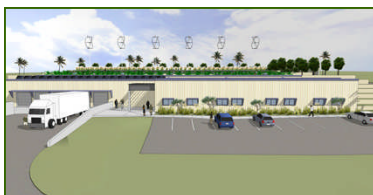
Artist's rendering of the new warehouse.

Convoy of Hope will soon begin construction of a 35,000-square-foot warehouse just outside of Port-au-Prince, Haïti.