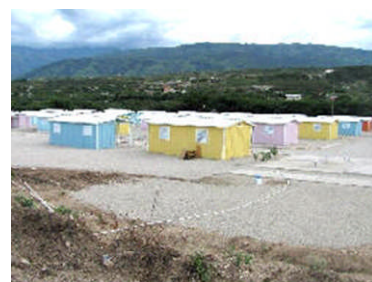
The new village takes shape—500 houses are being built.

Every home is being built with earthquake and hurricane resistant materials, with ramps for handicap access, and will be provided fully furnished for each resident.