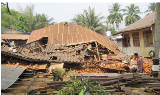
Damaged buildings in Tarlay