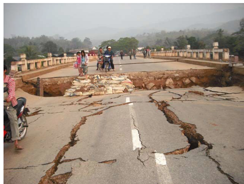
Damage to the bridge in Tarlay