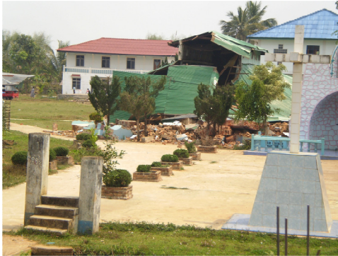
Tili Catholic Church

(source: Tearfund Partner – Mekong Minority Foundation)