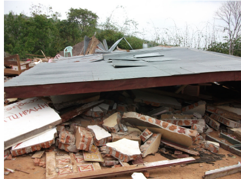
Kya Kuni Church