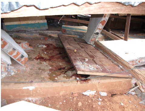
Many were killed or injured at the Kya Kuni Church