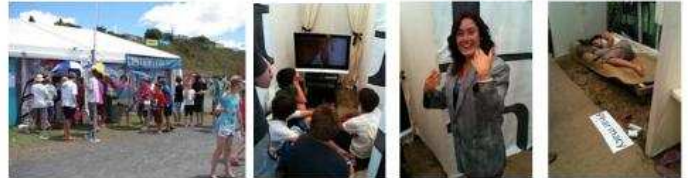
The Crowds Await