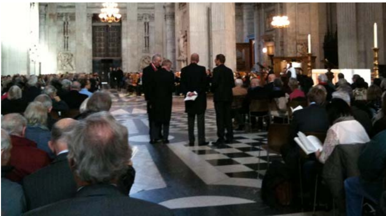
Stott Memorial Service