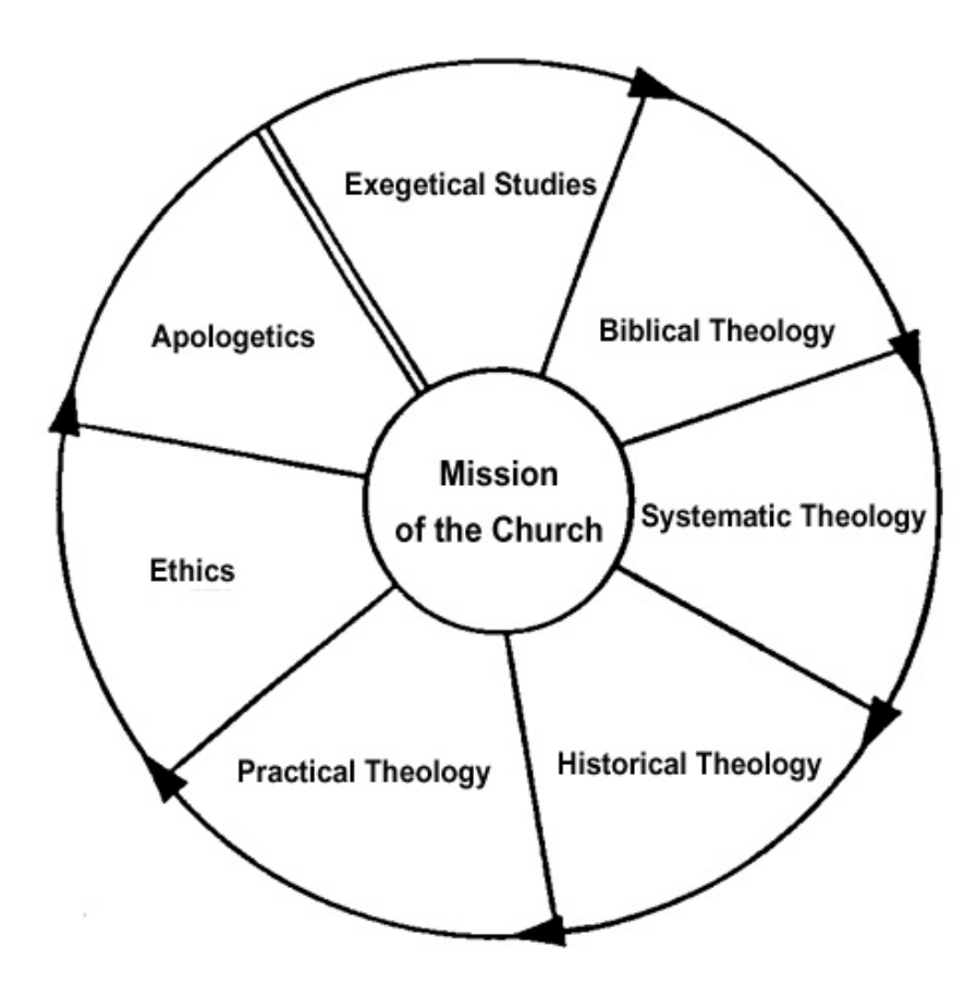
The mission idea should motivate and govern the theological work in all other fields

The following graph<sup>167</sup> demonstrates the centrality of the Great Commission to the motivation and direction of all other disciplines.