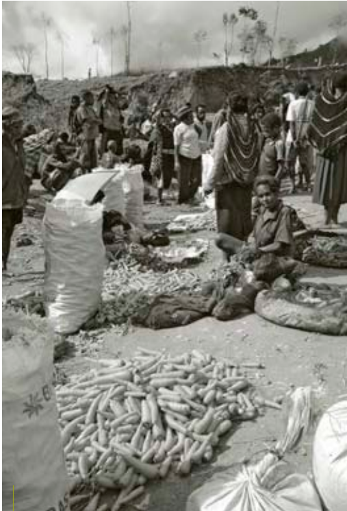
Every morning at the carrot market near Kurima town in the highlands of Papua province, Indonesia, buyers from Wamena city come to buy from the farmers. Around 2,000 farmers are reaping the long-term benefits of carrot farming.

The world has been shocked by two recent global crises and must reconsider the avenues to food security, argues David Lansley.