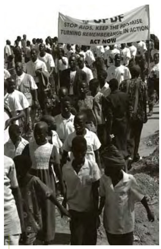
On World AIDS Day each year in Uganda, many people have marched to raise awareness, and to call for more funding and commitment to stop AIDS.