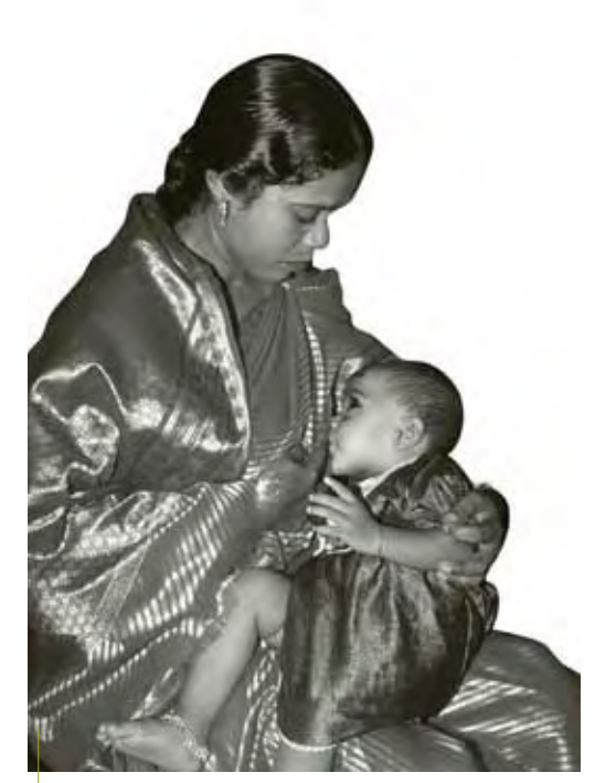
"I understand the importance of breastfeeding." World Vision's integrated nutrition project in Bangladesh, started in 1999, addresses the health problems of pregnant mothers and malnourished children.