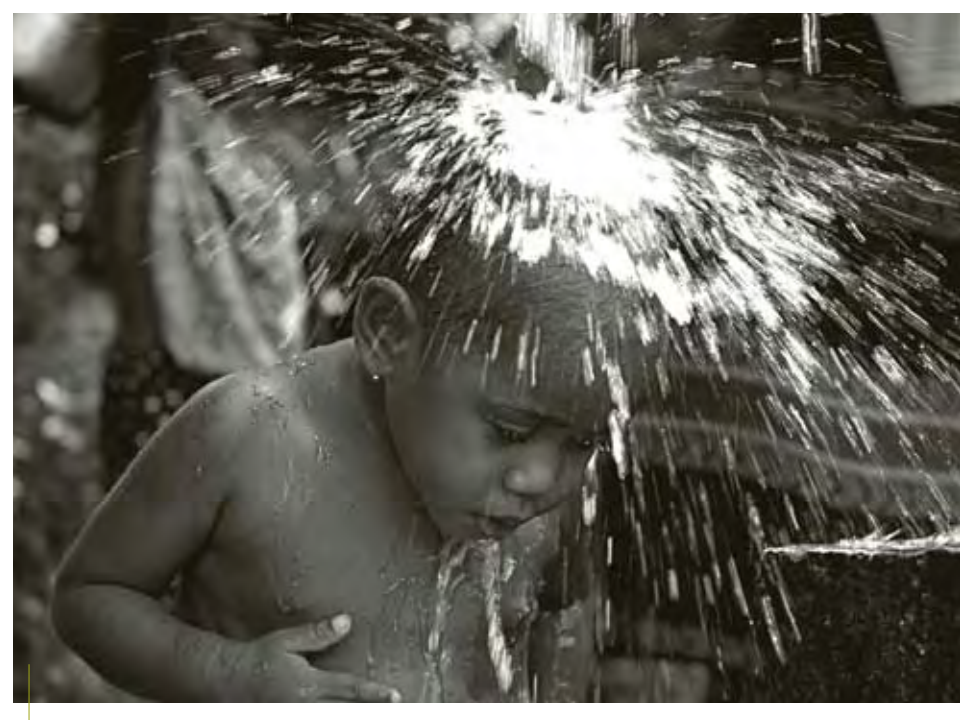
More than 700 people from the Maier and Barum villages of Papua New Guinea have access to clean water with the completion of new water wells in rural areas.